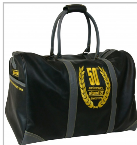
Stand 21 50th Anniversary travel bag

The profits from this product's sale will benefit the " Racing Goes Safer " Foundation for motorsport safety.